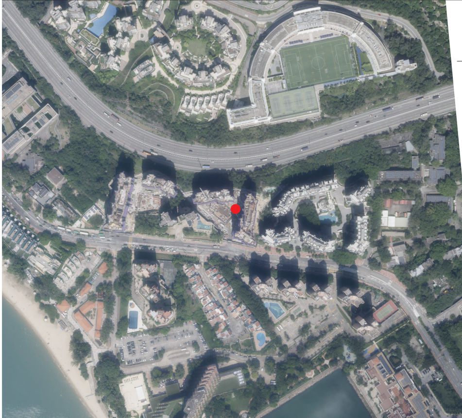
● Location of the Phase 期數的位置